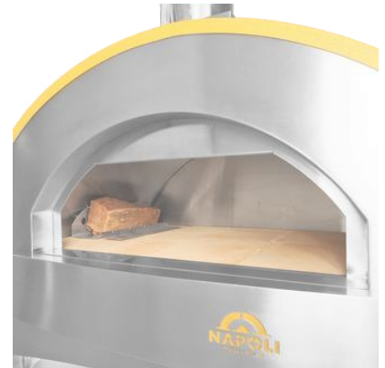
120mm refractory floor system